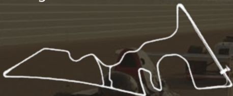
Circuit of the Americas December 8/9, 2020 Testing