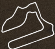
Sebring International Raceway December 17/18, 2020 Testing