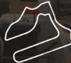
Sebring International Raceway February 15/16, 2021 Racing