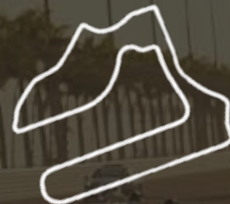
Sebring International Speedway January 27/28, 2021 Testing